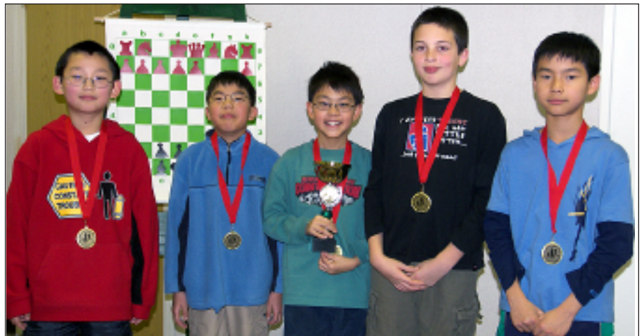
Westbrook Elementary's winning A Team - see Chatter Page 2

While the actual competition is held over two days, there will be other activities for visitors and there are plans to use the National event to highlight chess in Alberta through affiliated events.