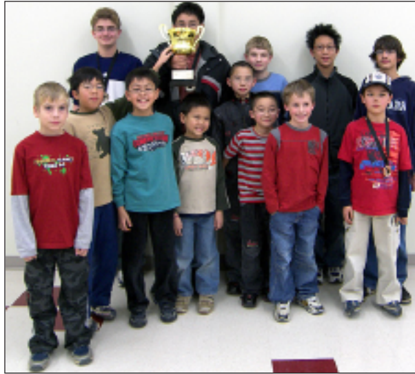
The winning North Team

Team North then went on to claim victory by scoring 9-3 in the final round, with the top section of the North getting a per-