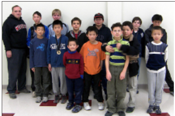
The runners-up South Team