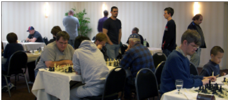
2006 Alberta Open scenes